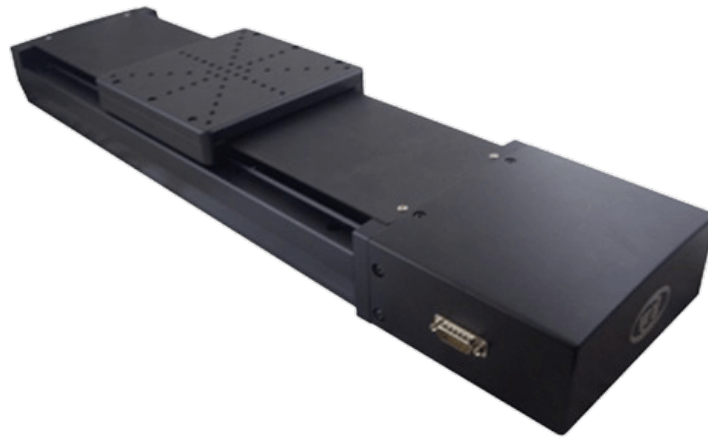
Product diagram of VL-210UPTA-H50

VL-210UPTA-H50 VL-210UPTA-(50-600)H is a sub-micron, travel-customizable ultra-precision motorized linear stage. Built with imported ball-screw and linear-slide guides, it offers a 179 \times 179 mm table, 35 – 50 kg load, 1 \mu m repeatability and up to 60 mm/s speed. Stepper-driven as standard, it can be upgraded to closed-loop servo and includes an integrated dust cover—ready for industrial, scientific or long-duration high-load applications.